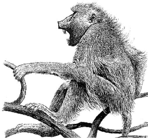
Figure 2: Baboon ( Papio ursinus ). These live in well-organised troops herded by large dominant males responsible for keeping order between quarrelsome members, if any.